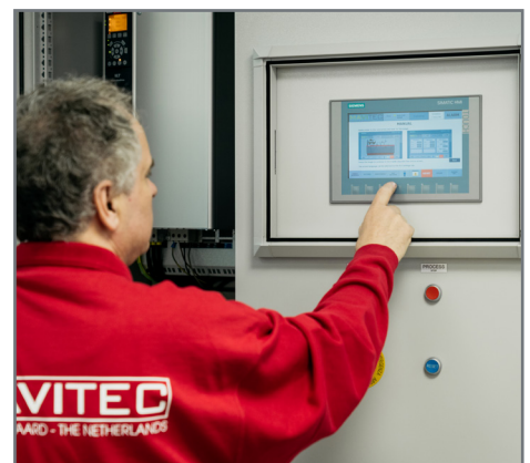
Touch screen control panel